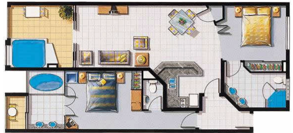
Two Bedroom Apartments – 108m 2