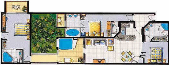
Three Bedroom Apartments – 168m 2